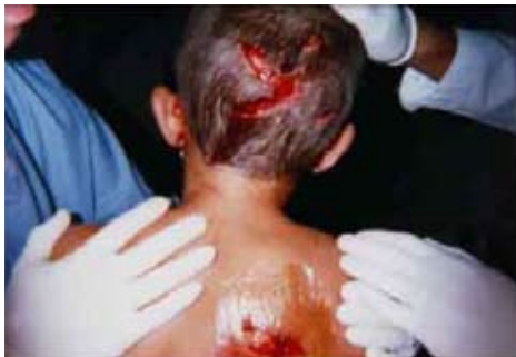
A young boy after a dog attack.

A study by Beck done in 1975 indicated that 87% of biting dogs are intact males and most dogs bites occur in or near the victim's home. Another study by Sacks in 1989 indicated that 70% of the children that were killed by dogs were under the age of 10 and 22 % were under the age of one year with 7% being sleeping infants.