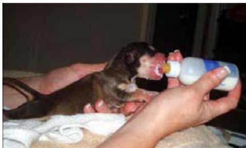
An orphaned pup on day 1 of using the above formula.

The normal rectal temperature for a newborn puppy is 95-99°F. If its rectal temperature is below 94°F degrees you are dealing with a potentially life-threatening case of hypothermia. The puppy needs to be warmed immediately. Take care not to overheat the puppy or warm it too quickly; this can be fatal in a weak puppy.