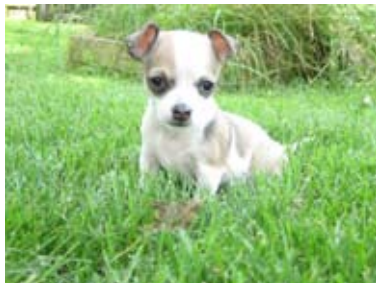
At 7 weeks