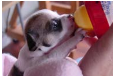
After a few weeks