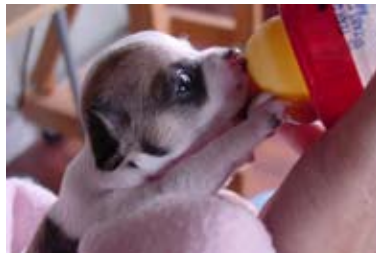
After a few weeks