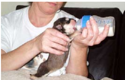
The same orphaned pup on day 10 of using the formula.