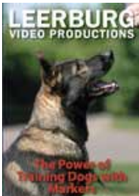
The Power of Training Dogs with Markers DVD