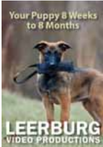
Your Puppy 8 Weeks to 8 Months DVD

So in closing there are several DVDs I have produced that will help new dog owners understand this work: