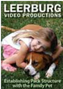
Establishing Pack Structure with the Family Pet DVD