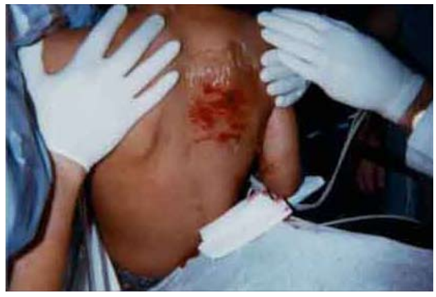
A young boy after a dog attack.

The best advice is to slowly turn sideways to the dog and divert your eyes from his (DO NOT STARE AT THE DOG.) Stand quietly and keep the arms down by your side. Dogs do not naturally give direct eye contact for any length of time. The only time they get or give eye contact is just before they attack, or just before they flee. So if you have a dominant dog getting direct eye contact from a child, the dog interprets the eye contact as prey that is about to run. That may be enough to trigger an attack.