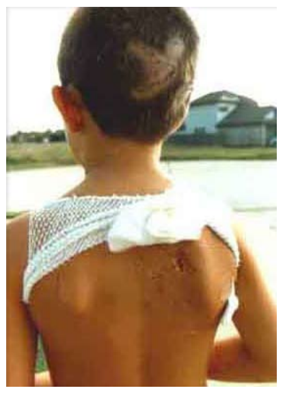
One week after an attack

Even though I sell training videos to teach people how to train police service dogs, personal protection dog's, and sport dogs, I would not hesitate to testify against someone who blatantly ignores sound, safe dog handling.