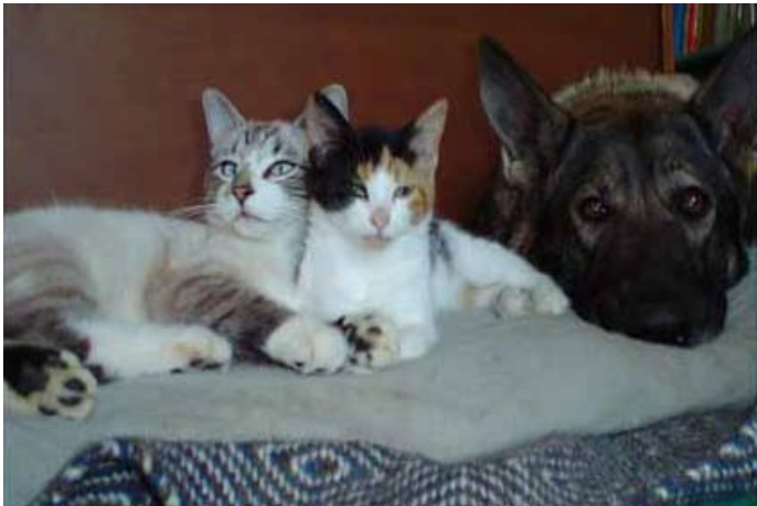
Lindy vom Leerburg II with some kittens